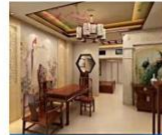
Building materials Industry